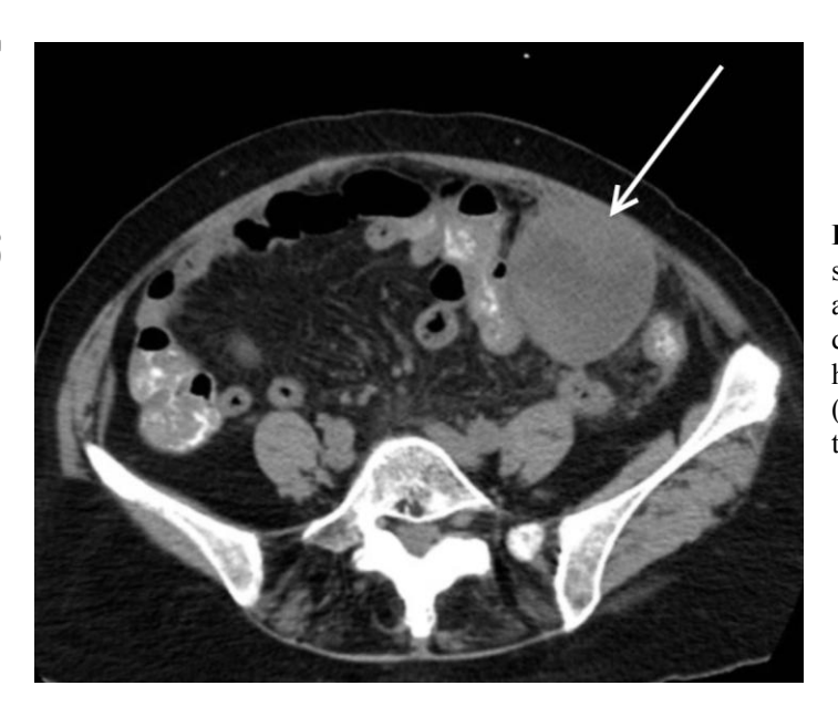
Figure 3 (left): 87 year old woman diagnosed with sarcomatoid renal cell carcinoma. Axial CT image of the abdomen obtained 5 months after left nephrectomy demonstrates a new round heterogeneous mass within the left hemiabdomen, abutting the transverse colon (arrow). (Protocol: 64 slice, Siemens, 100 mAs, 120 kV, 5 mm slice thickness. W:400, L:40. 100 mL intravenous Omnipaque).