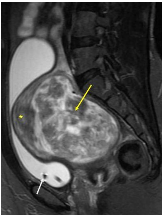
Figure 1 (left): 44 year old nulliparous woman with intramural fibroid and acute retention of urine. T2WI fat suppressed sagittal screening MR of the pelvis shows a heterogenous fibroid (yellow arrow), hyperintense relative to the uterine wall (asterix). Note the Foley's bulb in urinary bladder (white arrow) (Protocol: 1.5T MRI, TR: 5560ms, TE: 105.3ms)