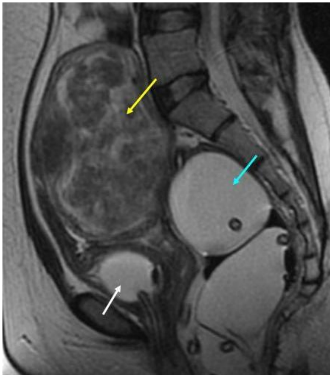
Figure 3 (left): 44 year old nulliparous woman with intramural fibroid and acute retention of urine. T2WI sagittal MR of the pelvis during treatment planning shows an inflated rectal balloon (blue arrow), empty urinary bladder with Foley's in situ (white arrow) bringing the fibroid (yellow arrow) close to the anterior abdominal wall. (Protocol: 1.5T MRI, TR: 4200ms, TE: 86.6ms)