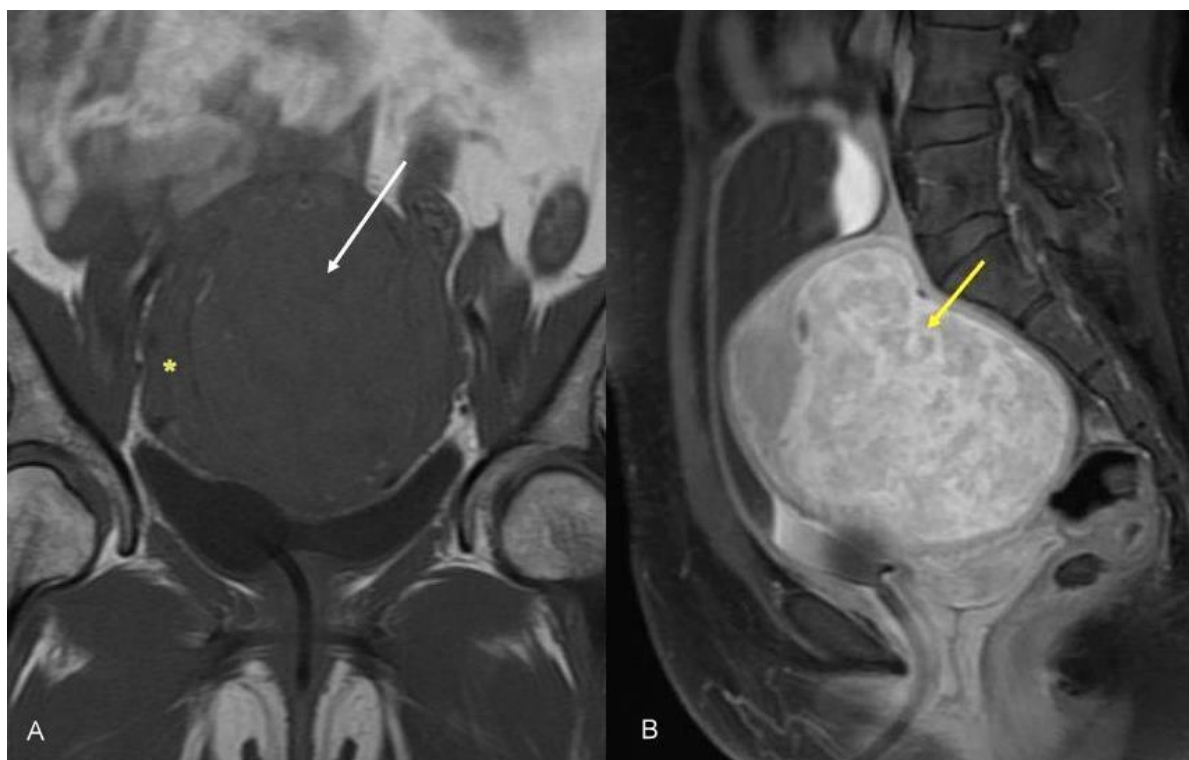
Figure 2: 44 year old nulliparous woman with intramural fibroid and acute retention of urine. A: T1WI coronal screening MR of the pelvis shows the fibroid (white arrow) isointense relative to the uterine wall (asterix). B: Contrast enhanced SPGR sagittal screening MR of the pelvis shows enhancement of the fibroid (yellow arrow). (Protocol- A: 1.5T MRI, TR: 720ms, TE: 13.2ms) (Protocol- B: 1.5T MRI, TR: 900ms, TE: 13.2ms, 10ml gadodiamide USP [Omniscan])