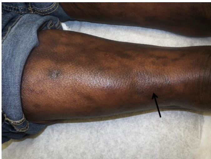
Figure 2: 58 year old female with a 2 year history of a hyperpigmented rash over her forearms and legs. Photograph of the leg shows numerous hyperpigmented macules coalescing into patches in a reticulated pattern (arrow). Diagnosis of Bazex syndrome was eventually made after radiologic work up.