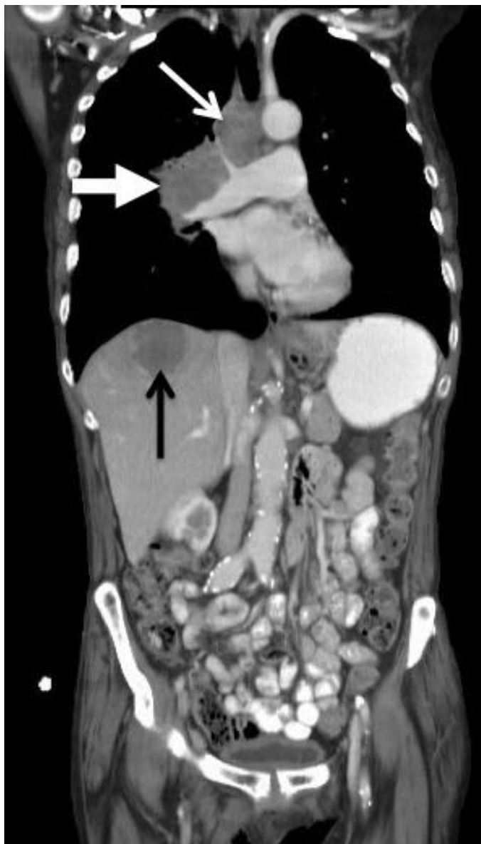
Figure 6 (left): 58 year old female with a 2 year history of a hyperpigmented rash who was found to have Bazex syndrome presented for CT after an abnormal chest radiograph. Contrast enhanced coronal reformatted CT images of the chest demonstrates the presence of large right perihilar soft tissue mass (thick white arrow), associated right paratracheal adenopathy (thin white arrow) and a focal right hepatic lobe metastatic lesion (black arrow). (protocol: 250 mAs, 120 kvp, 5mm slice thickness, venous phase, 100 cc isoview-300)