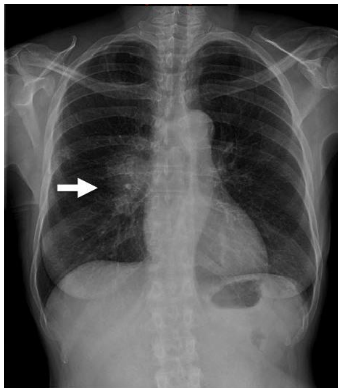
Figure 4: 58 year old woman with Bazex syndrome presented with 2 year history of a hyperpigmented rash and a chest radiograph was obtained. Posteroanterior chest radiograph demonstrates enlarged right hilum due to adenopathy (arrow).