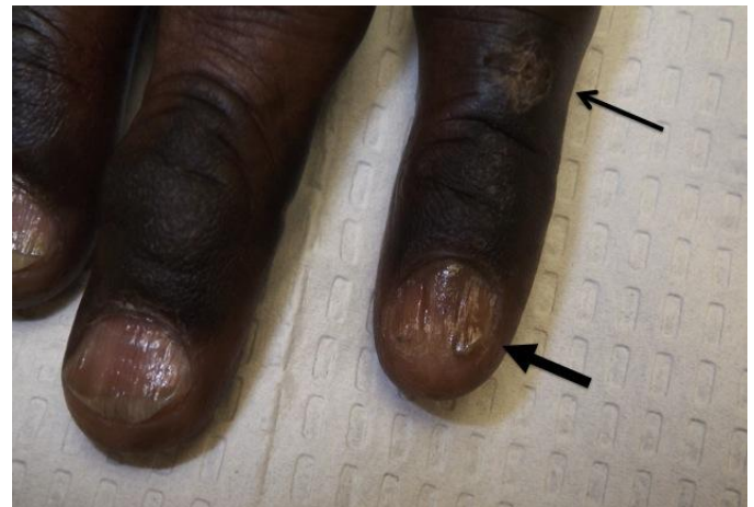
Figure 1: 58 year old female with Bazex syndrome who presented with hyperkeratotic plaques on her hands (arrow) and brittle nails (thick arrow). Picture of hand demonstrates hyperkeratotic plaques most prominent over joints. The nails are brittle and atrophied.