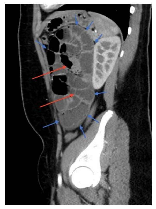
Figure 4: Sagittal reformatted contrast enhanced CT of the abdomen showing thin peritoneal membrane (blue arrow) encapsulating clusters of dilated small bowel loops (red arrow) in the left abdominal quadrants.