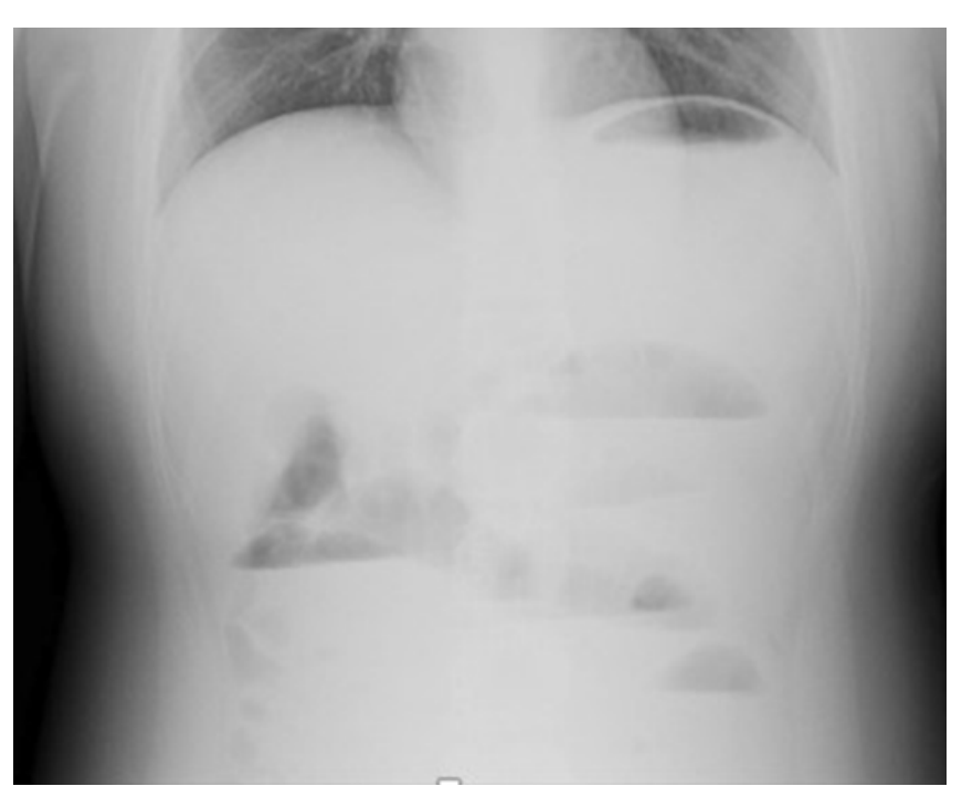
Figure 1: Plain radiograph of the abdomen showing dilated loops of bowels with air-fluid levels in the upper abdomen, predominantly on the left.