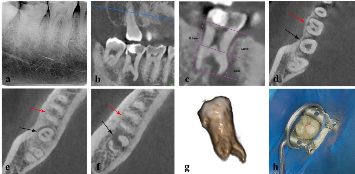
Figure 1: (a) Initial pretreatment radiograph illustrates extensive decay in the right mandibular second molar and abnormal root morphology. (b) Sagittal plane of CBCT image demonstrates taurodontism in mandibular second molar. (c) Measurement data indicates a taurodontism index of 55.56% (calculated as 7.5/13.5 \times 100\% ). (d) Cross-sectional CBCT image displays furcation involvement in tooth #46, while the pulp cavity is still visible in tooth #47. (e) Cross-sectional CBCT image displays mesial and distal roots in tooth #46, with only root bifurcation visible in tooth #47. (f) Cross-sectional CBCT image reveals two variant roots in tooth #47, contrasting with those in tooth #46. (g) 3-dimensional reconstruction views highlight the extended pulp cavity and the short and curved root. (h) Intraoral photograph showing dental dam placement, with teeth labeled by arrows. The red arrow indicates tooth #46, and the black arrow indicates tooth #47.