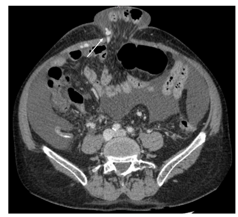
Figure 2: 56-year-old man with Flood Syndrome.

FINDINGS: Axial contrast enhanced CT of the abdomen in portal phase. Umbilical hernia with exit of intestinal loops and ascitic fluid. Cirrhosis and repermeabilization of the umbilical vein (white arrow) as signs of portal hypertension. TECHNIQUE: Axial CT, 190 mAs, 120 kV, 1mm slice thickness, 100 ml Omnipaque® 300.