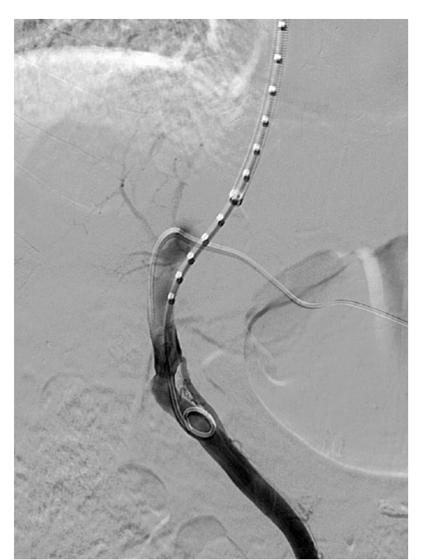
Figure 3: 56-year-old man with Flood Syndrome. FINDINGS: catheter introduced by jugular access reaching the main portal vein. TECHNIQUE: anteroposterior angiography with 20ml of Visipaque® 320.