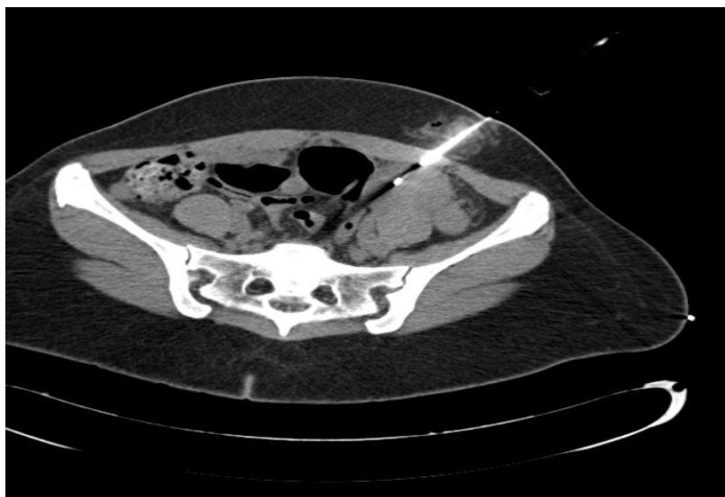
Figure 2: 43-year-old female with peritoneal soft tissue lesions found to be leiomyomatous in origin.

Findings: Axial (A-C), coronal (D-F), and sagittal (G-I) images demonstrating innumerable homogenous rounded soft tissue lesions within the abdominal and pelvic peritoneal spaces with similar appearing morphology and density (white arrows). Of note, there is a globular and heterogenous appearance of the uterus (red arrows). Incidentally seen is a dilated gallbladder containing subtle hyperdense debris.