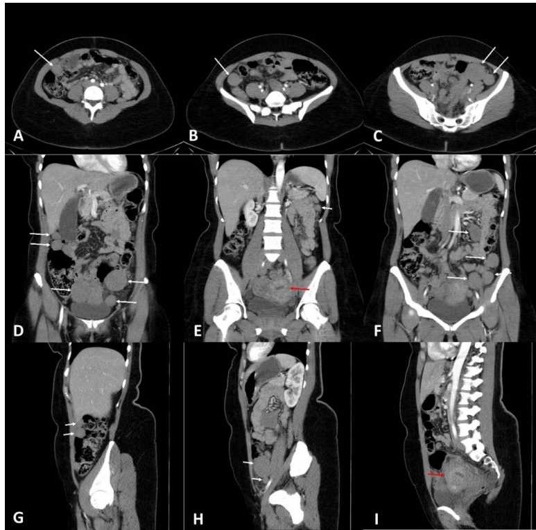
Figure 1: 43-year-old female with peritoneal soft tissue lesions. These lesions were biopsy-proven to be leiomyomatous in origin.

Technique: Contrast enhanced computed tomography (CECT) scan of the abdomen and pelvis obtained during arterial phase (Phillips, 128 mAs, 120 kV, CTDIvol: 8.4 mGy, DLP: 430.7 mGy*m. 5mm slice thickness, 100 mL Isovue 300).