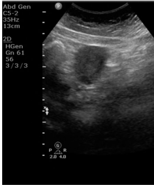
Figure 3: 43-year-old female with peritoneal soft tissue lesions found to be leiomyomatous in origin.

Technique: Abdominal ultrasound. 35 Mhz curvilinear transducer.