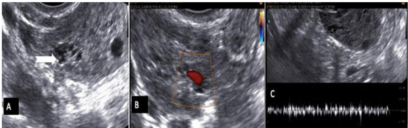
Figure 2: 24-year-old female with ovarian and pelvic filariasis

Technique: Real-time ultrasound images of the pelvis acquired on Samsung Sonoace R7 with 4-9 MHz transvaginal probe.