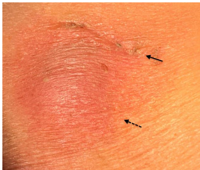
Figure 2: 84 y/o female with Mycobacterium abscessus infection of a venous port. Suspected infection of Venous port.

Technique: Supine frontal Chest Radiograph (Siemens AXIOM-Artis Interventional system): kVp: 73 and mAs: 91