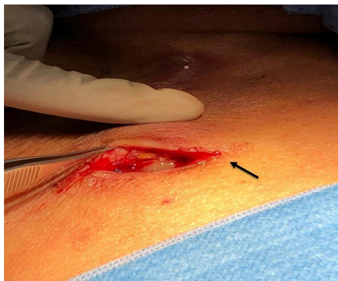
Figure 3: 84 y/o female with Mycobacterium abscessus infection of a venous port. Confirmed infection of Venous port, with pus seen.

Findings: Photograph taken on POD 36 of the right anterior chest wall subcutaneous pocket (dashed arrow) and incision (solid arrow), showing erythema and swelling.