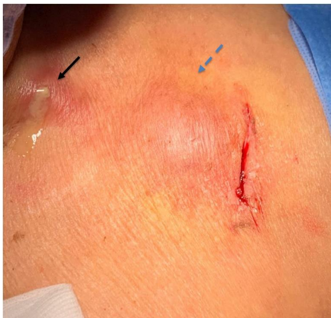
Figure 4 (left): 84 y/o female with Mycobacterium abscessus infection of a venous port. After removal of venous port as well as washing and irrigation.

Findings: Photograph after removal of the venous port. The neck wound (solid arrow) and subcutaneous pocket (dashed arrow) were both reopened and both sites were washed and irrigated with normal saline.