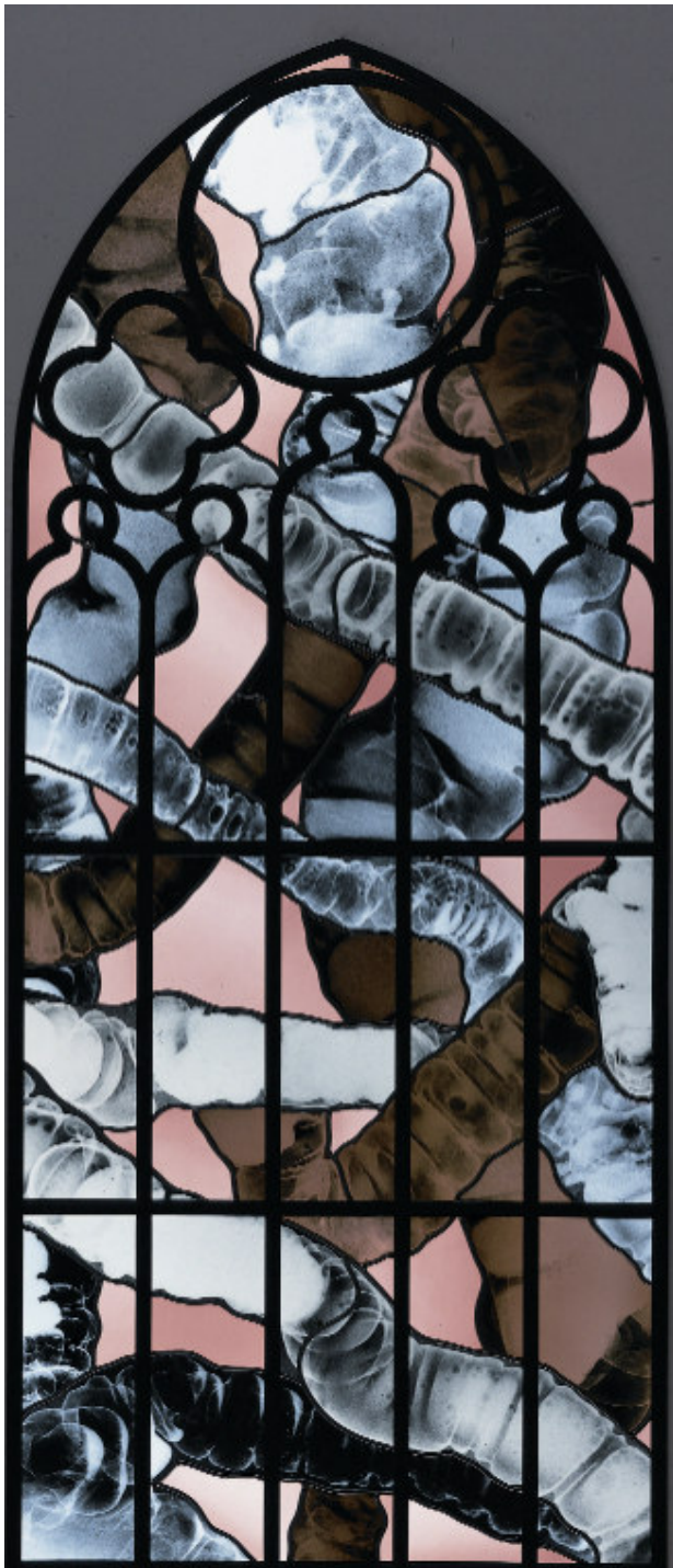
Figure 2: September detail, 2001, 244 x 104 cm, steel, X-rays, lead, glass, collection Katoen Natie, Antwerp