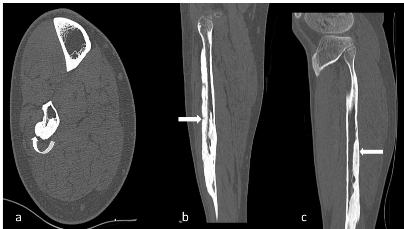
Figure 3: 28-year-old male with melorheostosis.

Findings: Selected axial (Figure 3a) with reconstructed coronal (Figure 3b) and sagittal (Figure 3c) images of a non-contrast computed tomography of the leg show lobulated undulating periosteal and endosteal thickening partially encroaching the medulla, corresponding to MRI low signal abnormality (arrows). No fractures are evident.