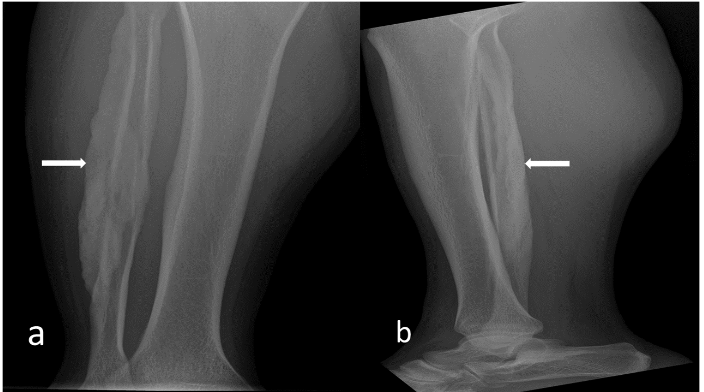
Figure 1: 28-year-old male with melorheostosis.

Findings: (a, b) Anteroposterior and lateral radiographs of the right leg show sclerosis on the posterior lateral aspect of the proximal two-thirds of the fibula with periosteal and endosteal cortical thickening, consistent with the classic dripping wax appearance (arrows).