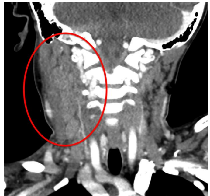
Figure 2: 7 year old male patient: Diagnosis of Ulceroglandular Tularemia

Findings: Contrast enhanced coronal CT image of the neck soft tissues, 24 days prior to the ultrasound images, demonstrate multiple enlarged, enhancing, right cervical lymph nodes [red circle]. Findings were found to be consistent with reactive lymphadenopathy, seen in the setting of Tularemia. Suppurative lymphadenopathy is not demonstrated at this time.