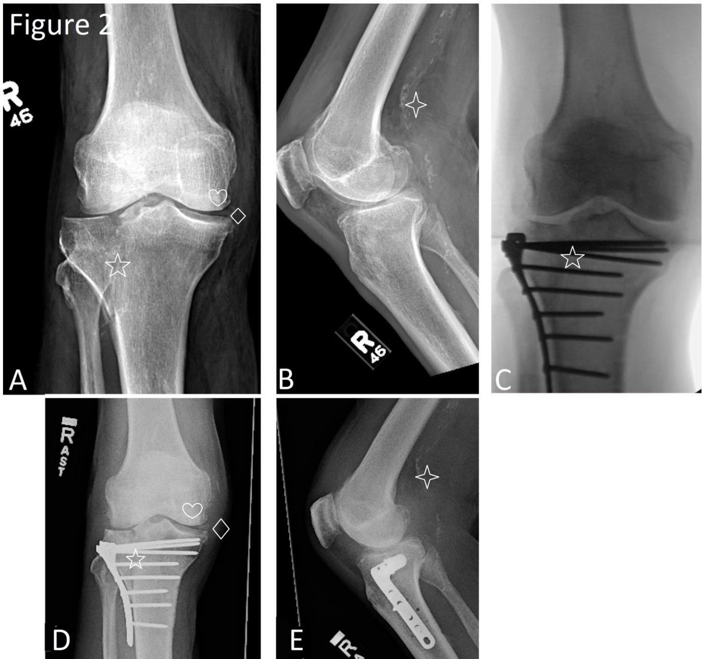
Figure 2: 82-year-old male with a comminuted Schatzker II fracture of the lateral right tibial plateau with depression and incidentally discovered calcification of the anterior cruciate ligament.

Findings: Antero-posterior and lateral radiographs of the right knee. A.) Preoperative antero-posterior radiograph demonstrating the tibial plateau fracture (star symbol), degenerative changes of the medial compartment (heart symbol) and chondrocalcinosis of the medial meniscus (diamond symbol). Of note, calcification of the anterior cruciate ligament is not visualized. B.) Preoperative lateral radiograph demonstrating atherosclerosis (four pointed star symbol). Again, calcification of the anterior cruciate ligament is not visualized. C.) Intraoperative antero-posterior radiograph demonstrating tibial plateau fracture (star symbol) adjacent origin of anterior cruciate ligament with poorly visualized ligament and calcification. D.) Antero-posterior and E.) lateral radiographs of the right knee following the fixation of the fracture with plate and screws demonstrate the tibial plateau fracture in near anatomic alignment with hardware in place as denoted by the star symbol. Degenerative changes of the medial compartment (heart symbol), chondrocalcinosis of the medial meniscus (diamond symbol) and atherosclerosis (four pointed star symbol) remain unchanged. Of note, in this view, the anterior cruciate ligament is still poorly visualized and calcification within the region cannot be confirmed.