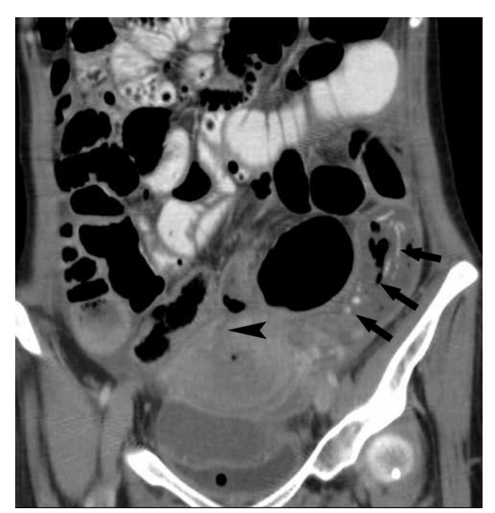
Figure 4: A 21 year old female patient with uterine perforation and abdominal expulsion of fetal parts. Contrast enhanced CT was obtained on Philips Brilliance 16 slice CT machine with 100 ml non ionic contrast solution injected with pressure injector at 2.5 ml/sec flow rate using the following parameters- mAs-250, Kv-120 , slice thickness- 3mm, increment- 3mm, collimation- 16x1.5, pitch 0.938 . Oblique coronal multiplanar reconstruction (MPR) image (slab- approx 10mm) shows extruded fetal parts in the left iliac fossa comprising of mainly the spine and limbs along with multiple foci of air (arrows). The uterine perforation site is also well seen as a hypoattenuating area in the fundus (arrowhead)

Figure 5 (right): A 21 year old female patient with uterine perforation and abdominal expulsion of fetal parts. Intraoperative photograph demonstrating the fundal defect (arrowheads) and the extruded fetal limbs (arrows)