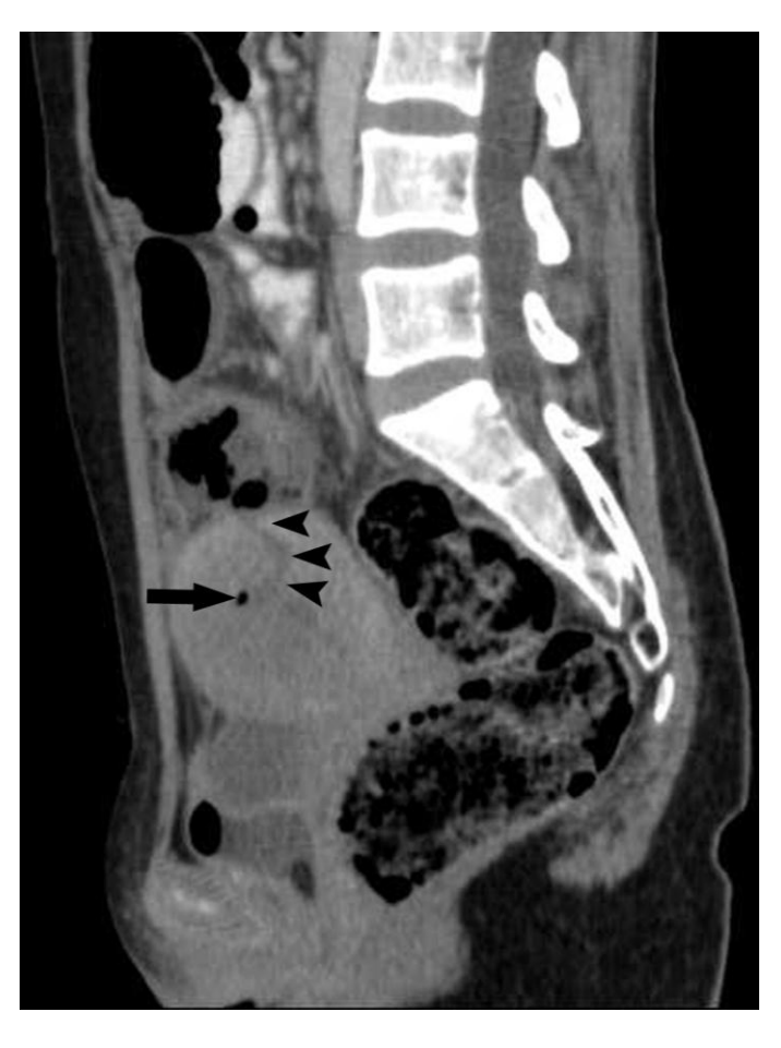
Figure 3: A 21 year old female patient with uterine perforation and abdominal expulsion of fetal parts. Contrast enhanced CT was obtained on Philips Brilliance 16 slice CT machine with 100 ml non ionic contrast solution injected with pressure injector at 2.5 ml/sec flow rate using the following parameters- mAs-250, Kv-120 , slice thickness- 3mm, increment- 3mm, collimation- 16x1.5, pitch 0.938. Sagittal multiplanar reconstruction (MPR) image (slab- approx 10mm) shows the fundal perforation as a hypoattenuating defect in the myometrium (arrowheads) along with a focus of air within the endometrial canal (arrow).